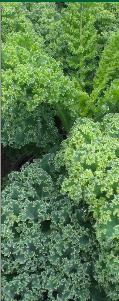
Organic 606 Variety Pack Super Foods

Cut along dotted line for standard bench card size.