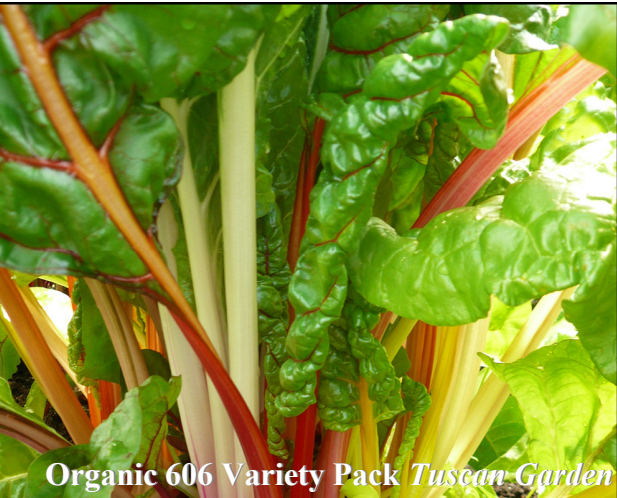
Organic 606 Variety Pack Tuscan Garden