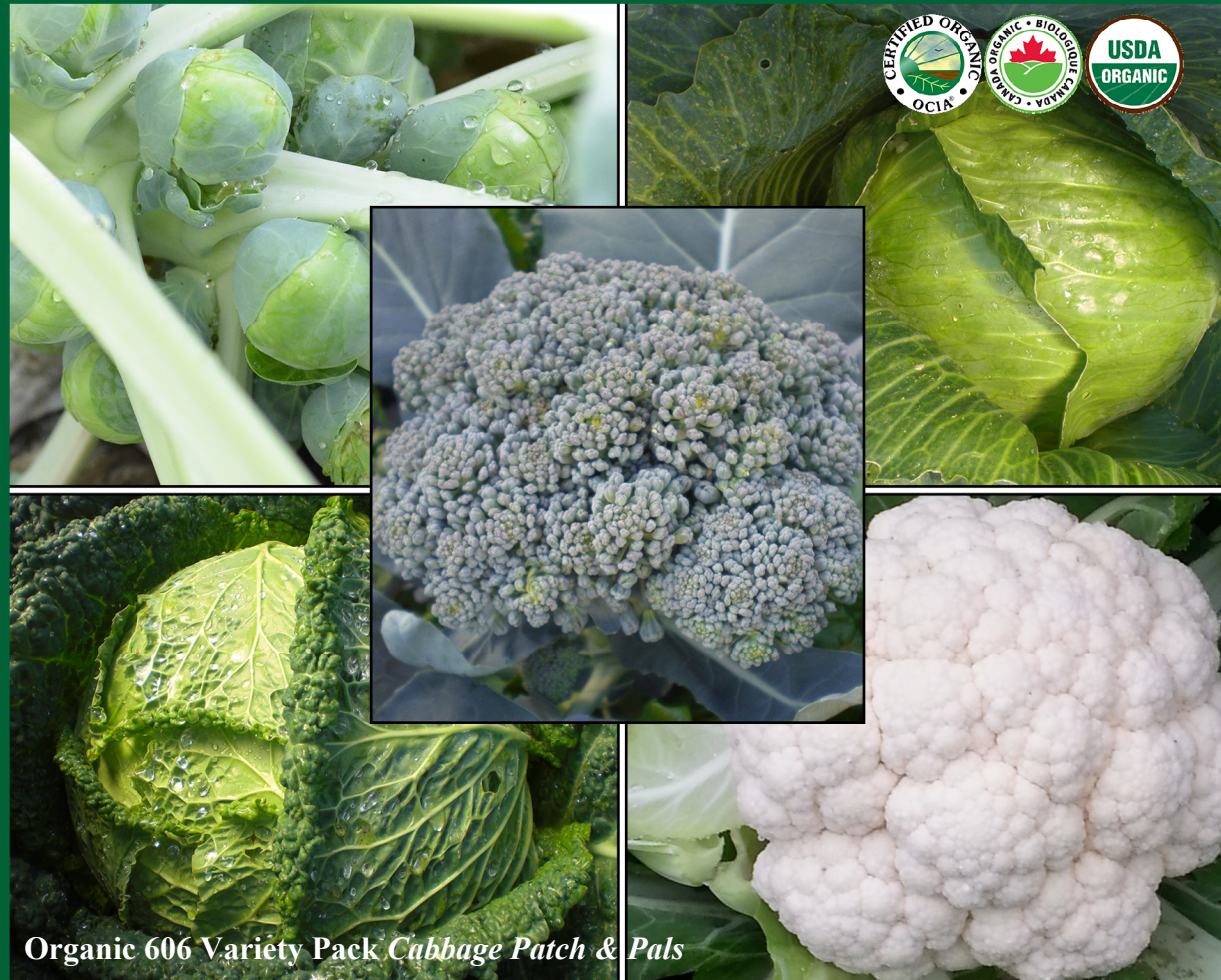
Organic 606 Variety Pack Cabbage Patch & Pals

Cut along dotted line for standard bench card size.