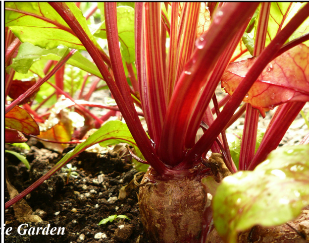
Organic 606 Variety Pack Colourful Veggie Garden

Brighten up any veggie garden! Contains two each of Bright Lights Swiss Chard and Detroit Supreme Beets, and one each of Lacinato Black Magic Kale and Rouge d'Hiver Romaine Lettuce.