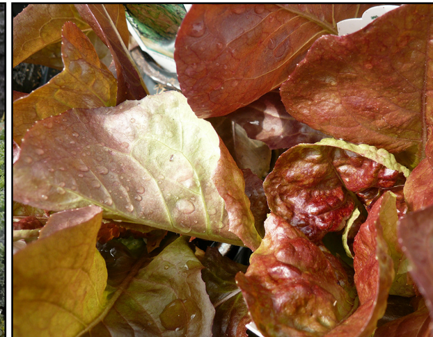
Organic 606 Variety Pack Heirloom Salad

Cut along dotted line for standard bench card size.