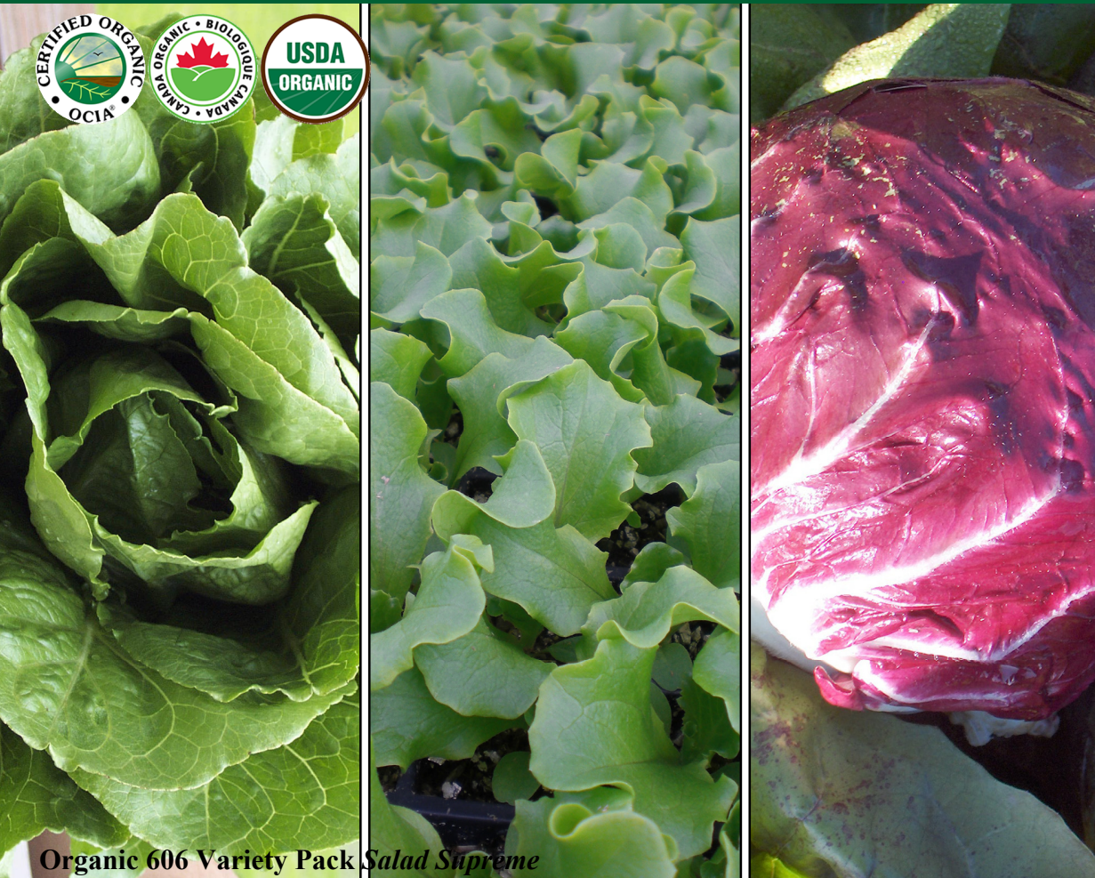
Organic 606 Variety Pack Salad Supreme

Tried & True Organic Edibles WWW.TRIED-AND-TRUE.COM